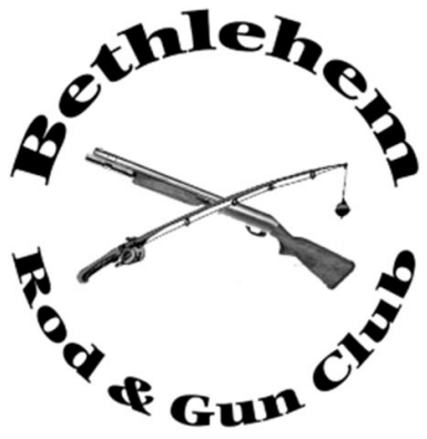
Fish Fry cont'd